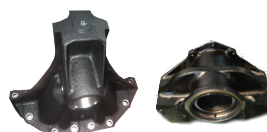
Bracket & Seat Trunion Assy