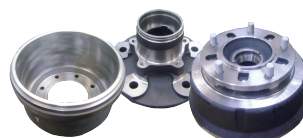
Hub & Brake Drum Assy